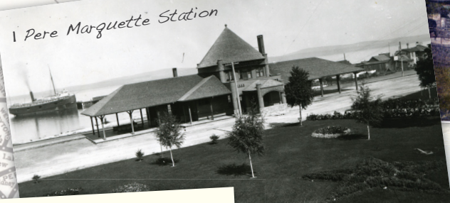
1 Pere Marquette Station