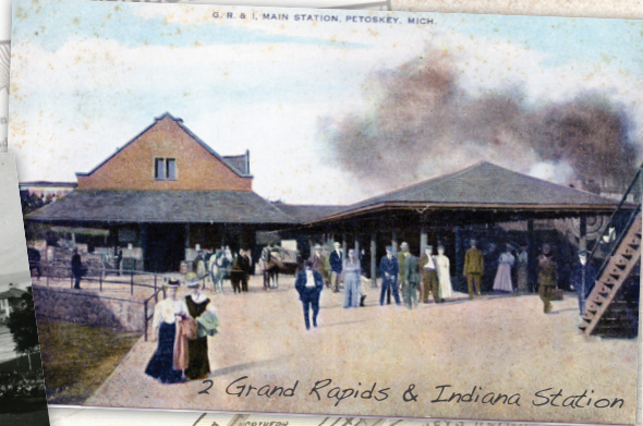
2 Grand Rapids & Indiana Station