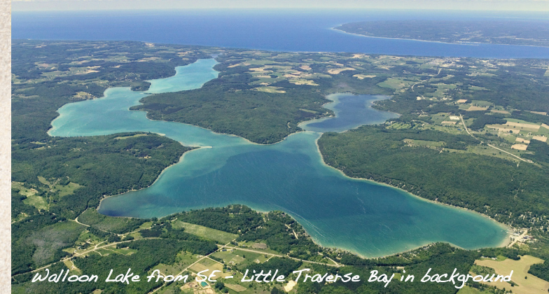
Walloon Lake from SE - Little Traverse Bay in background

In 1898, Ernest Hemingway's parents fell in love with Northern Michigan. They built a summer cottage on Walloon Lake, and called it Windemere. Ernest Hemingway would visit Northern Michigan every summer from his birth year, 1899, until he was married at Horton Bay in 1921.