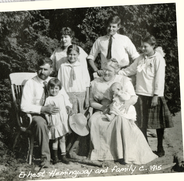
Ernest Hemingway and family c. 1915