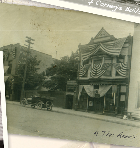
4 The Annex