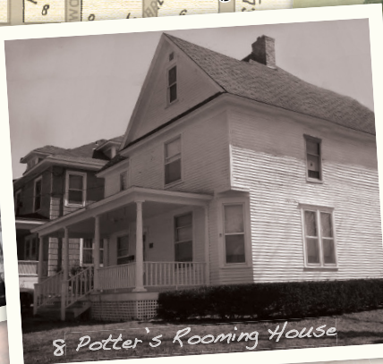
8 Potter's Rooming House