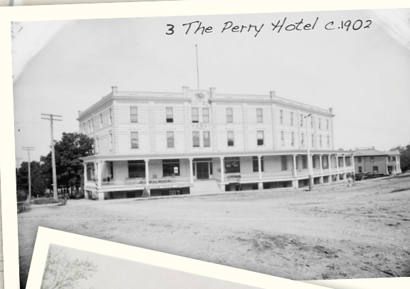
3 The Perry Hotel c.1902