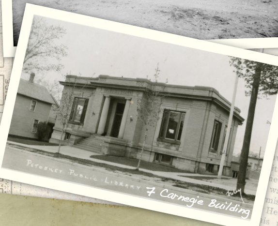
7 Carnegie Building