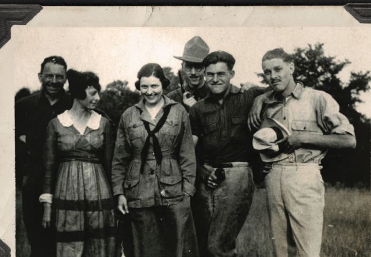
Ernest Hemingway (Clockwise from top left)

-Ernest with cane, suitcase, and a wine bottle in his pocket. Petoskey, 1919