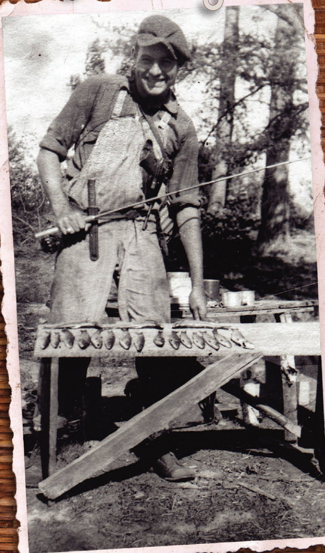
Ernest Hemingway's Northern Michigan