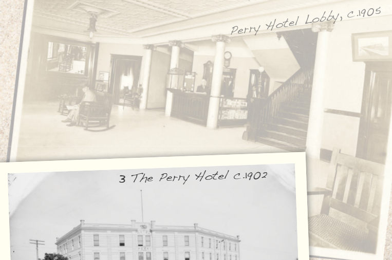
Perry Hotel Lobby, c.1905