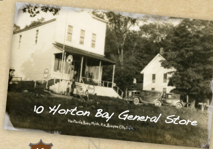
10 Horton Bay General Store

See back panel for Map Locations identification. For more detailed information and map locations visit www.MIHemingwayTour.org